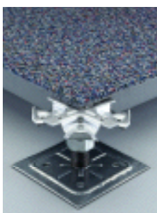
Finished Floor Heights: 2-1/2" to 5"

The ConCore / PosiLock System provides the interstitial space to supply power, voice, data, and HVAC to the work environment above.