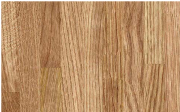
White Oak Natural