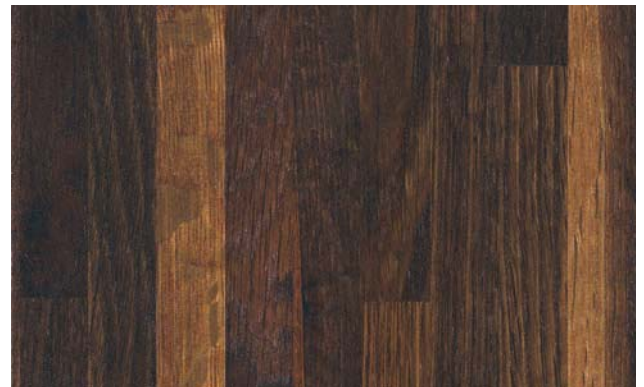
White Oak Dark